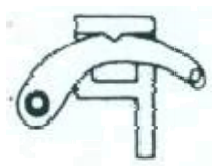
TO LOWER A LOAD